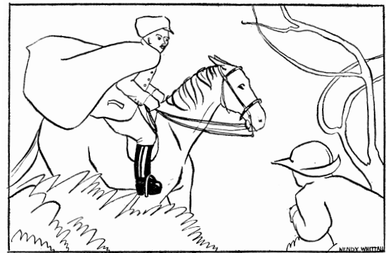
Presently a horseman came riding along the road from the south