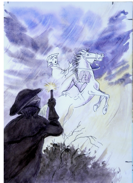
Illustration from Vol 6

and we discovered it featuring in the 1968 Annual of Judy for Girls .